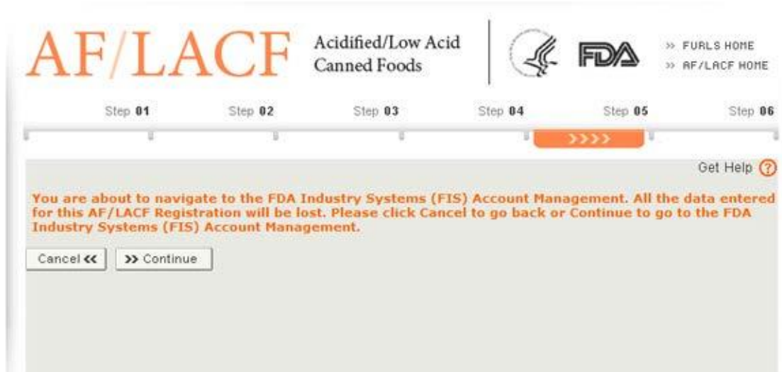
Figure 16: Warning Message When Navigating to FIS Account Management

If the user selects “Cancel,” none of the information already entered will be lost. However, if the contact information for the ECP is not correct, the only way to correct it is to proceed to Account Management in the FIS Electronic Portal and correct the information in that system. (See Figure 17 for a picture of the FIS Account Management screen.)