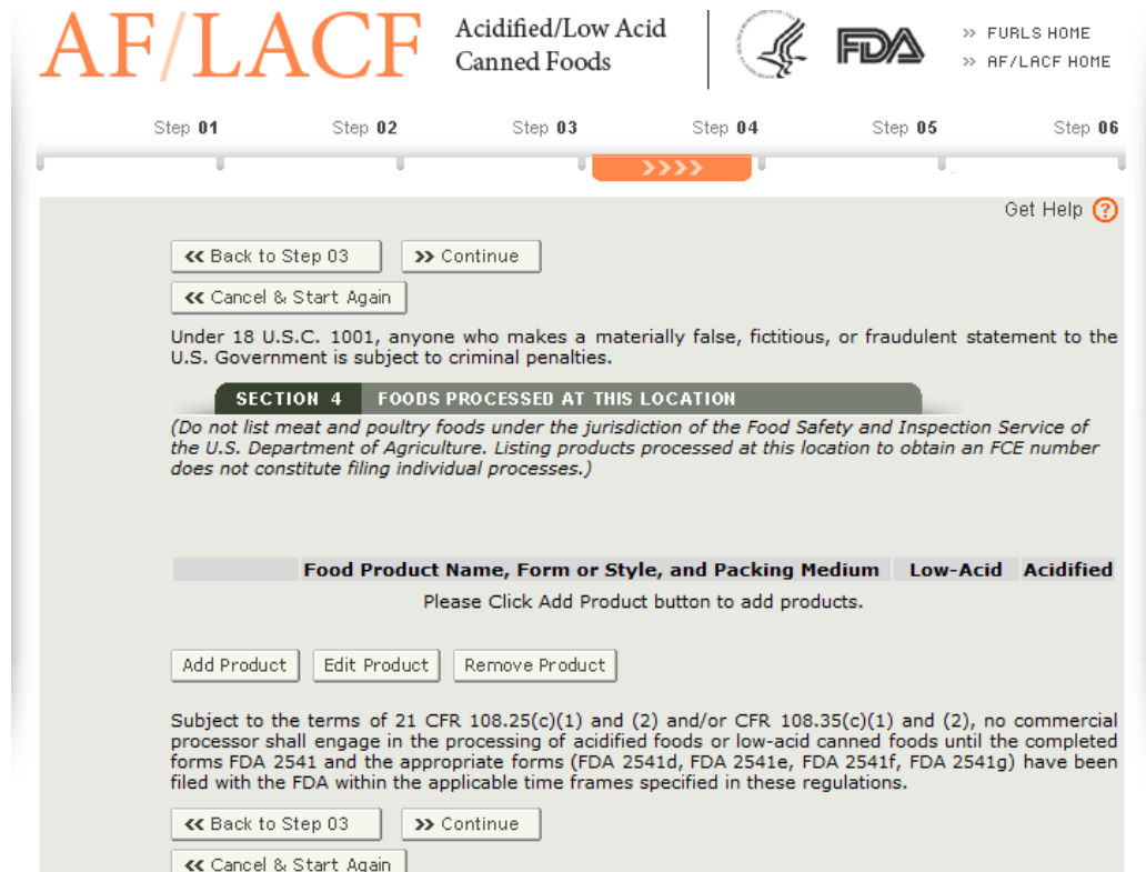
Figure 9: Step 4 - Section 4 Foods Processed At This Location - Add First Product