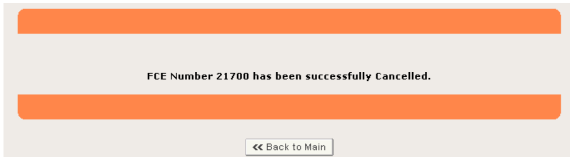
Figure 26: Cancelled Registration Message